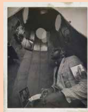
Images taken from his Guest Projects Digital piece Oracle Afronaut. As a result of the residency the work has been included in ICF's Diaspora Pavilion 2: London programme.

For more information about Oracle Afronaut visit www.guestprojects.com/steloolive